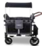
Charcoal Gray with White Frame