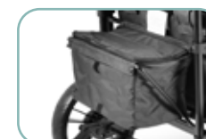
Removable Rear Basket with Zipper Cover