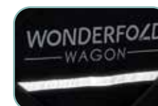
Reflective Safety Strip

For the most up to date information, please visit: www.wonderfold.com