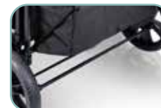
Easy One-Step Foot Brake