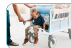
Front zippered entrance provides easy access for kids, their equipment, or their service animal