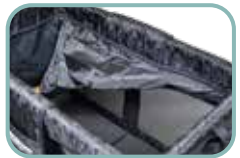
Zippered Mesh Panels for Privacy and Wind Cover