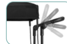
Adjustable Push Handle with PU Leather Cover