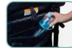
Additional Pouches on the Back Panel of Carriage