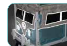
Functional LED headlights & Reflective Trim