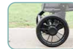
All Terrain Wheels with Bearings & Suspension