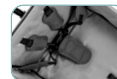
Removable Seat Pads with 5-Point Harnesses