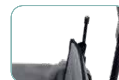
Retractable Canopy Rods