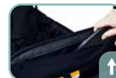
Additional Storage in the Seatbacks