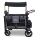
Charcoal Gray with Black Frame