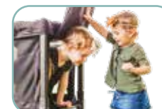
Front zippered entrance provides easy access for kids, their equipment, or their service animal

For the most up to date information, please visit: www.wonderfold.com