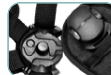
Automatic Magnetic Buckle (only with X4M models)