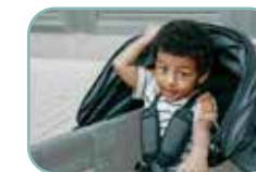
Removable, Retractable & Reversible Canopy