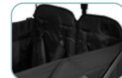
Removable Seat Pads with 5-Point Harnesses