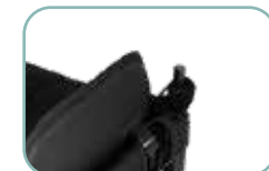
Retractable Canopy Rods