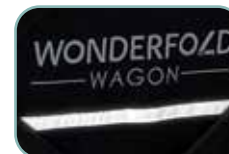
Reflective Safety Strip

For the most up to date information, please visit: www.wonderfold.com