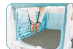
Zippered Mesh Panels for Privacy and Wind Cover