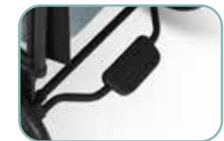
Easy One-Step Foot Brake