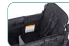
Removable, Raised & Reclining Face to Face Seats with 5-Point Safety Harnesses