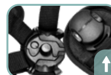
Automatic Magnetic Buckles