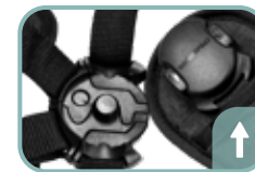
Automatic Magnetic Buckles