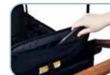
Additional Storage in the Seatbacks