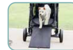
A hideaway pet ramp with an anti-slip surface.