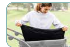
Zippered Mesh Panels for Privacy and Wind Protection