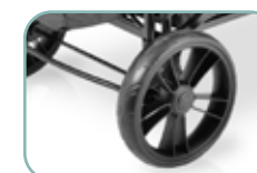
All-Terrain PU Tires with Bearings & Suspension