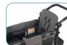
Removable, Raised & Reclining Face to Face Seats with 5-Point Safety Harnesses