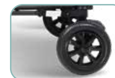
All Terrain EVA Tires with Bearings & Suspension