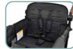
Removable, Raised, & Reclining Face to Face Seats with 5-Point Safety Harnesses, and a Single Rider Option