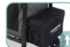
Rear Storage Basket