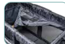
Zippered Mesh Panels for Privacy and Wind Cover