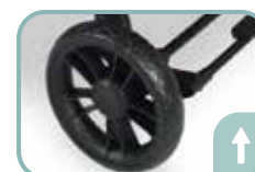
All Terrain EVA Tires with Bearings & Suspension