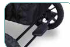
Easy One-Step Foot Brake