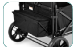
Removable Rear Basket with Zipper Cover