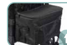
Rear Storage Basket with Extra Pouches