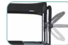
Adjustable Push Handle with Neoprene cover