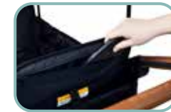
Additional Storage in the Seatbacks