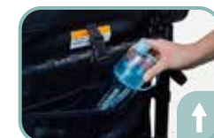
Additional Pouches on the Back Panel of Carriage