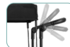
Adjustable Push Handle with PU Leather Cover