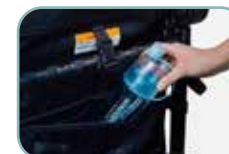
Additional Pouches on the Back Panel of Carriage