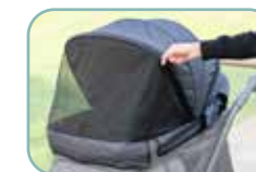
Attachable Shade Net