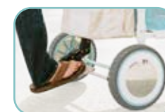
Easy One-Step Foot Brake