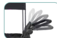
Adjustable Push Handle with a Neoprene cover