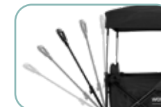
Telescoping Pull Handle with Spring Bounce Technology