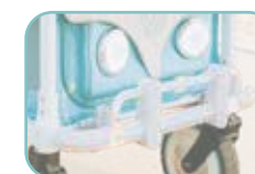
Removable Front Bumper to Store a Skateboard

For the most up to date information, please visit: www.wonderfold.com