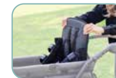
Removable, Raised, & Reclining Seat with a 5-Point Safety Harness