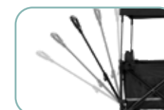
Telescoping Pull Handle with Spring Bounce Technology