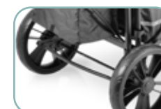
Easy One-step Foot Brake