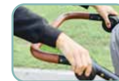
Adjustable Push Handle with Vegan Leather Cover