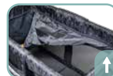
Zippered Mesh Panels for Privacy and Wind Cover