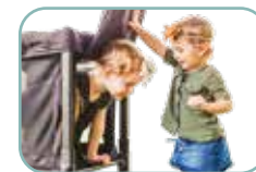
Front zippered entrance provides easy access for kids, their equipment, or their service animal