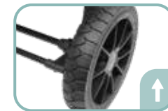
XL All Terrain PU Tires with Bearings & Suspension