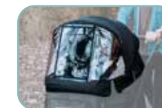
Attachable Wind Cover

For the most up to date information, please visit: www.wonderfold.com