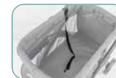
Removable Pet Leash