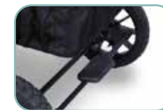
Easy One-Step Foot Brake

For the most up to date information, please visit: www.wonderfold.com