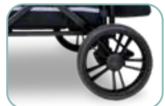
All-Terrain PU Tires with Bearings & Suspension