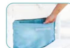
Additional Pouches on the Back Panel of Carriage