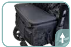
Rear Storage Basket with Extra Pouches