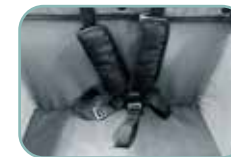
Removable Seat Pads with 5-Point Safety Harnesses