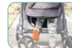
Front & Back Zippered Entrances