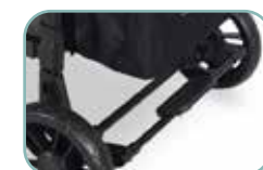
Easy One-Step Foot Brake