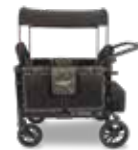
Shadow Green Camo