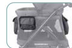
Removable Pouches on Both Sides of the Stroller Wagon