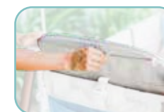
Additional Storage in the Seatbacks