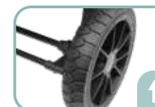
XL All Terrain PU Tires with Bearings & Suspension