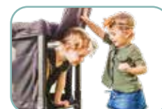
Front zippered entrance provides easy access for kids, their equipment, or their service animal

For the most up to date information, please visit: www.wonderfold.com