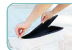
Rear Storage Basket with Extra Pouches