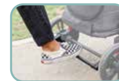
One Step Foot Brake